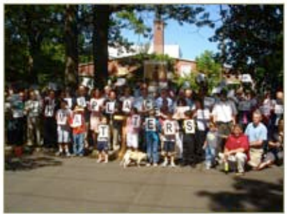
This Place Matters campaign at the Tesla site

c you for your generosity and support. Toget